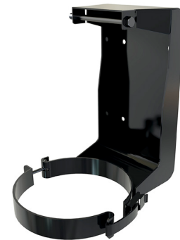
Mounting Bracket (Optional)

ACCORDING TO THE REQUIREMENTS OF EUROPEAN PRESSURE EQUIPMENT DIRECTIVE (PED) 2014/68/EU ART. 4.3, WITHIN THE OPERATING LIMITS PROVIDED ON VESSEL NAMEPLATE AND SUMMARIZED BELOW, THESE FILTERS ARE DESIGNED AND MANUFACTURED IN ACCORDANCE WITH THE SOUND ENGINEERING PRACTICE AND EXEMPT FROM CE MARKING AND CERTIFICATION: 10 BAR(G) @ 35°C FOR AV-GAS AND JET FUEL.